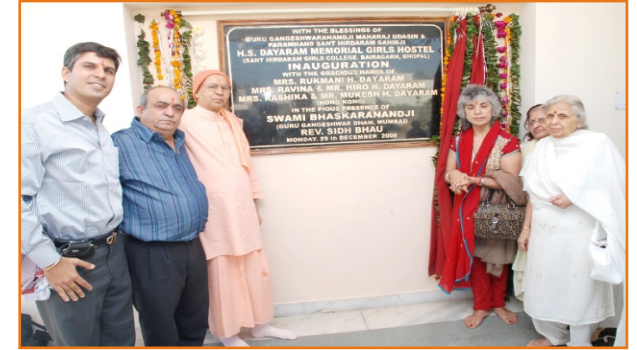
Harkishindas S. Dayaram Memorial Girls Hostel