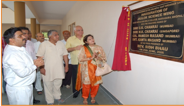
Jaslok Science Wing