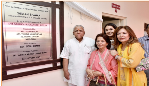
Shivlani Bhawan (K.T. Shahani Hr. Sec. School)