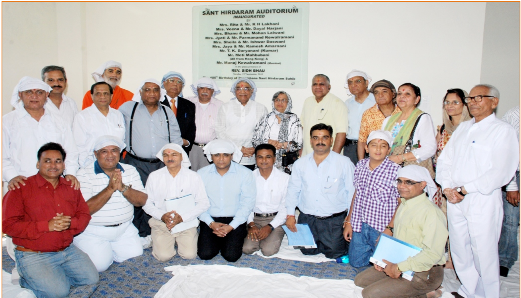
PHILANTHROPISTS FROM HONG KONG WITH VOLUNTEERS ON THE INAUGURAL CEREMONY OF SANT HIRDARAM AUDITORIUM (21 September 2006)