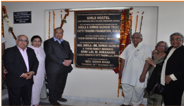
Daswani-Ratti Girls Hostel