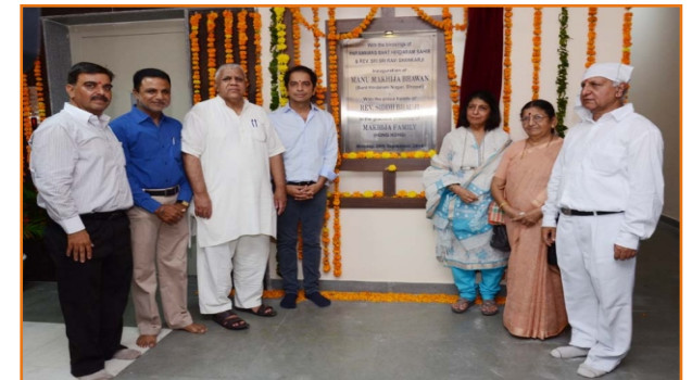
Manu Makhija Bhawan (MBA College for Girls)