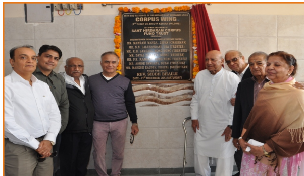
Corpus Wing (Arogya Kendra)