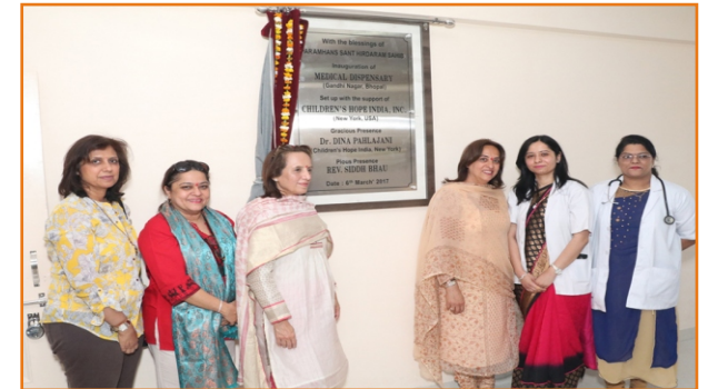
CHI Medical Dispensary