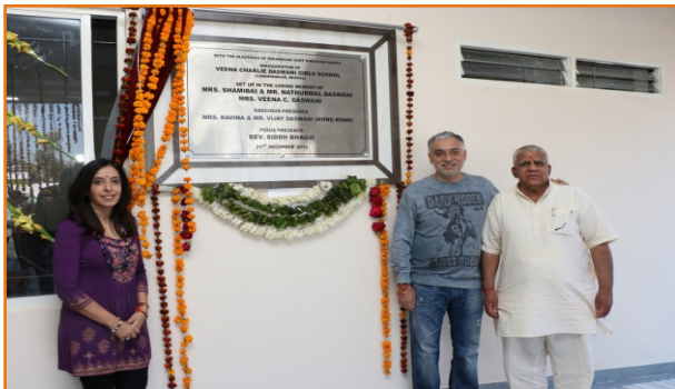
Veena Charlie Daswani Girls School